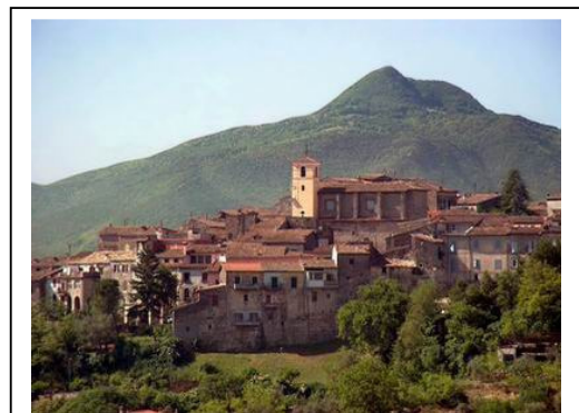
Ferentino, historical centre

Go back, overcome the crossing for Fumone that was travelled upon during the incoming trip and soon there is a new irregular uphill slope (some gradients of approx. 10%) up to another crossroads in the vicinity of Fumone